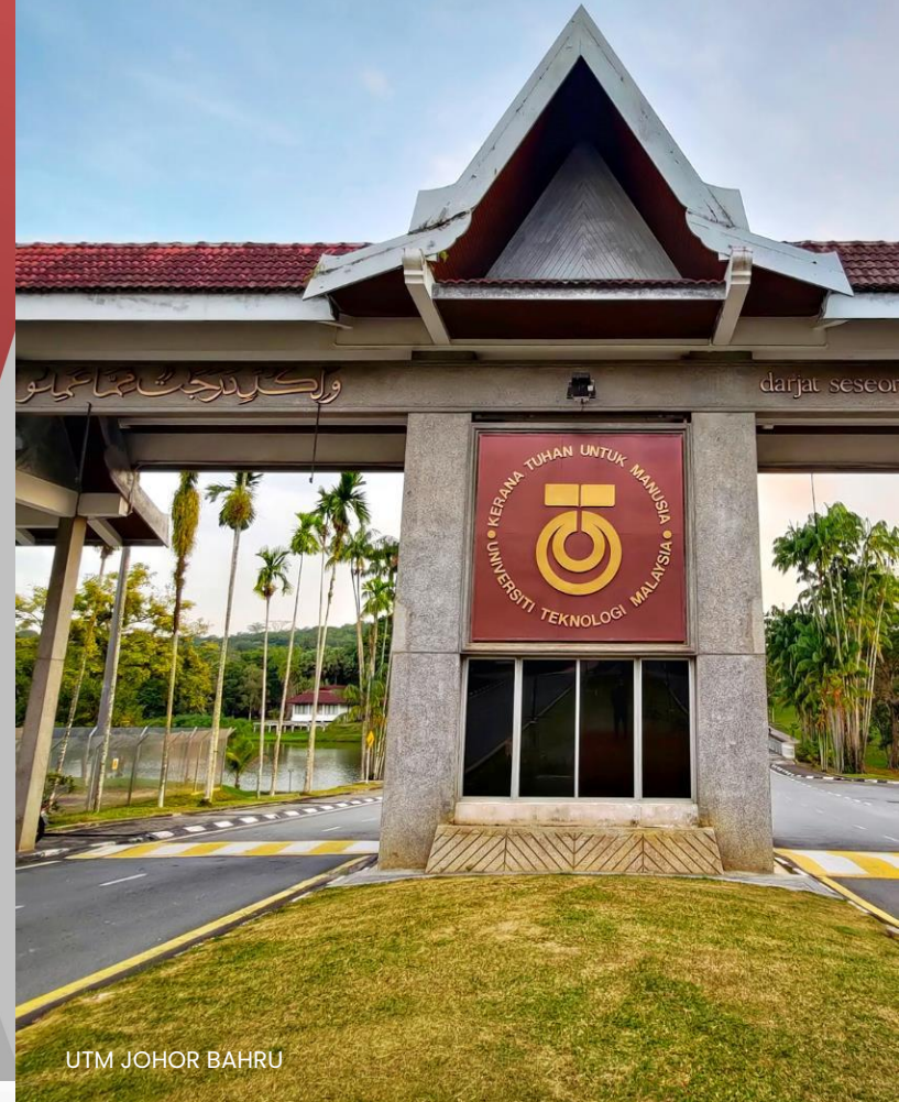
UTM JOHOR BAHRU